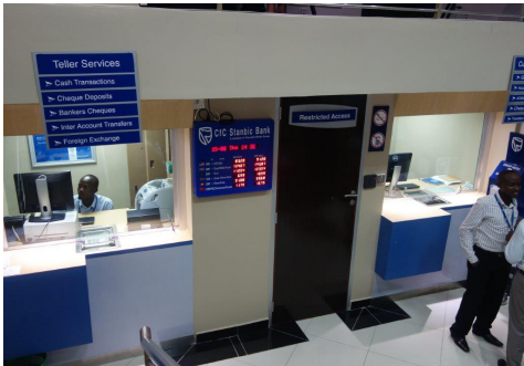
CFC Bank - Malindi Branch