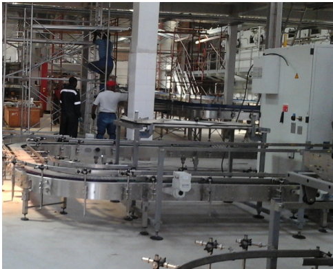
Mt. Kenya Bottlers Plant