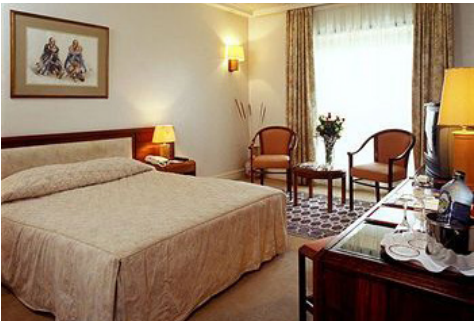
Kenya Utalii Rooms