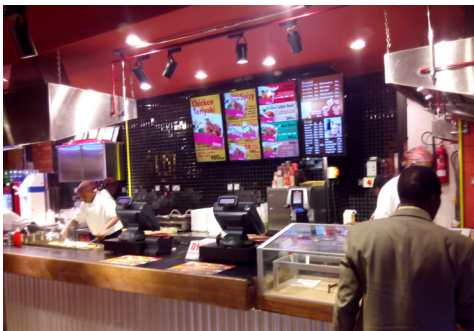
Teriyaki Japan Restaurant