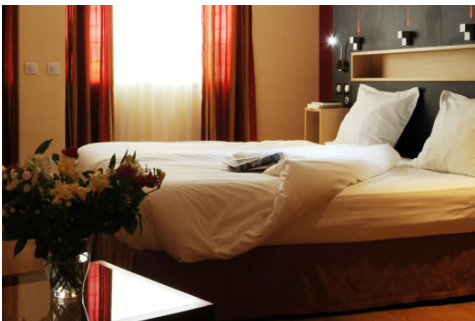
Norfolk Towers Apartments