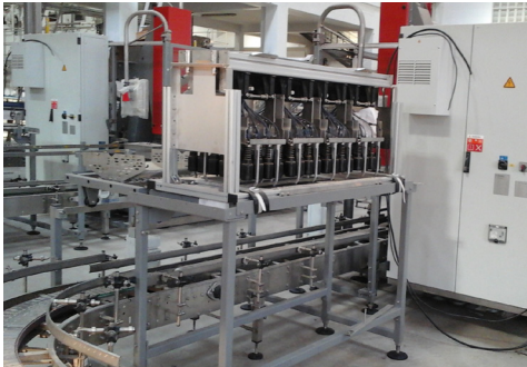
Mt. Kenya Bottlers Plant