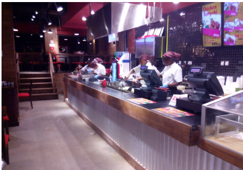
Teriyaki Japan Restaurant