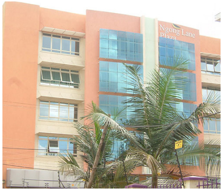
Ngong Lane Plaza